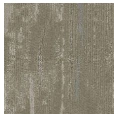
Nest 38760 LRV 13.1 | L* 42.92