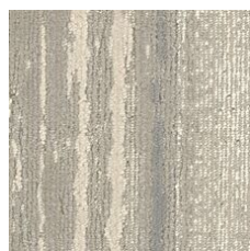
Awaken 38506 LRV 25.6 | L* 57.67