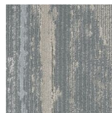
Dwell 38535 LRV 14.3 | L* 44.69