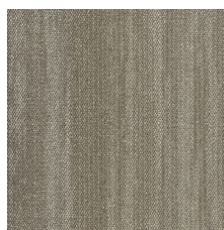
Earthy 72761 LRV 14.2 | L* 44.45