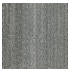
Island 72595 LRV 12.4 | L* 41.83