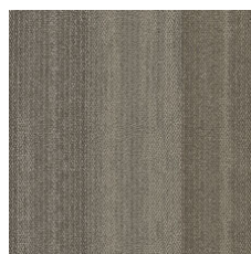
Village 72760 LRV 12.6 | L* 42.17