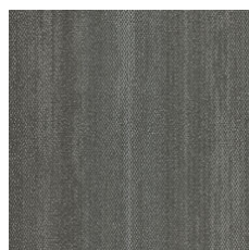
Urban 72557 LRV 7.2 | L* 32.32