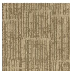
Pavillion 36715 LRV 15.6 | L* 46.41