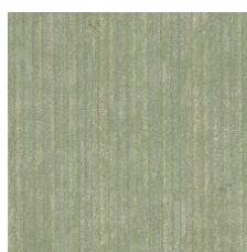
Bamboo 36335 LRV 16.6 | L* 47.71