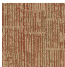
Koi 36713 LRV 11.4 | L* 40.26