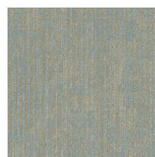
Sky 36447 LRV 18 | L* 49.49