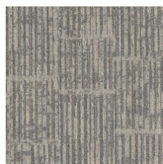
Stone 36530 LRV 17.7 | L* 49.18