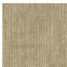
Sand 36103 LRV 20.8 | L* 52.77