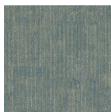
Dragonfly 36315 LRV 10.5 | L* 38.76