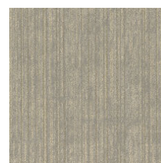
Lantern 36515 LRV 20.8 | L* 52.75