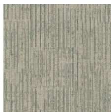
Pond 36300 LRV 19.6 | L* 51.42