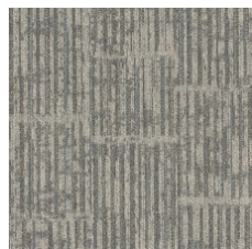
Stone 36530 LRV 17.7 | L* 49.18