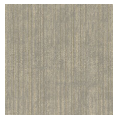
Lantern 36515 LRV 20.8 | L* 52.75