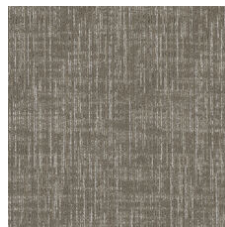
Clay 83761 LRV 10.9 | L* 39.36