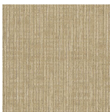
Cork 83170 LRV 19.5 | L* 51.3