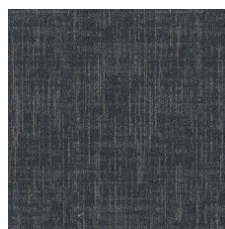
Night 83496 LRV 3.7 | L* 22.72