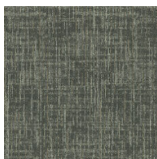
Nuance 83314 LRV 7.4 | L* 32.79