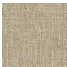
Bisque 83111 LRV 19 | L* 50.72