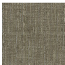
Swept 83322 LRV 8.6 | L* 35.15