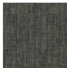
Underground 83505 LRV 3.7 | L* 22.5