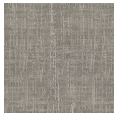
Zinc 83515 LRV 14.1 | L* 44.36