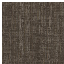
Canyon 83750 LRV 5.3 | L* 27.51