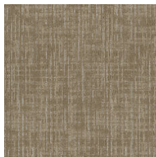
Suede 83755 LRV 13 | L* 42.73