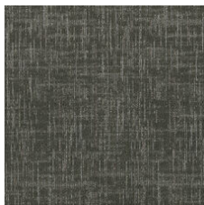
Carbon 83585 LRV 6.7 | L* 31.05