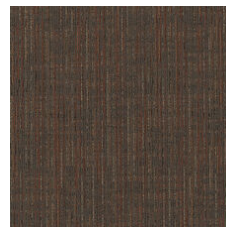
Brazen 83805 LRV 4.3 | L* 24.52