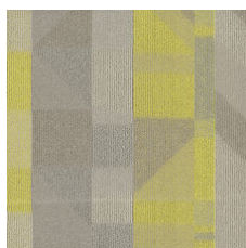
Clarity Lime 86111 LRV 20.3 | L* 52.15