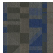
Achieve Blue 86761 LRV 5.1 | L* 27.02