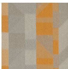
Clarity Orange 86112 LRV 20.2 | L* 52.03