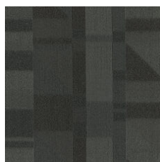
Escape 86505 LRV 2.8 | L* 19.37