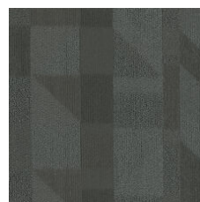
Transform 86585 LRV 6.4 | L* 30.41