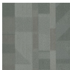
Experience 86535 LRV 12.7 | L* 42.34