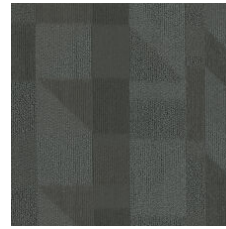
Transform 86585 LRV 6.4 | L* 30.41