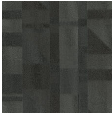
Escape 86505 LRV 2.8 | L* 19.37