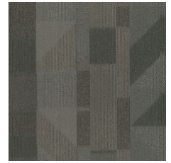
Achieve 86760 LRV 5.8 | L* 29