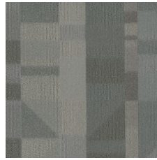
Nuance 86515 LRV 16 | L* 47.04