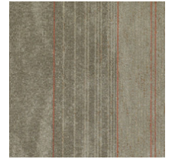
Smoky Quartz 14761