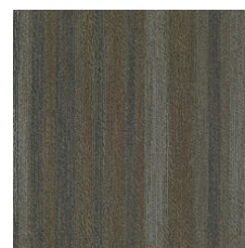
Cast Bronze 92601