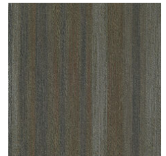
Cast Bronze 92601