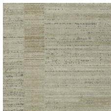
Natural Silk 99111