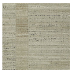
Natural Silk 99111