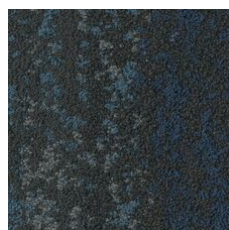
Lava Springs 05440 LRV 7