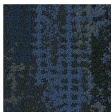
Deepest Skies 05486 LRV 5.3