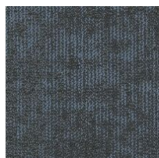
Flora 05411 LRV 8.2 | L* 34.47