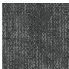
Wild 05557 LRV 9.4 | L* 36.75