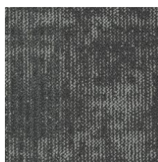
Fragile 05760 LRV 12.4 | L* 41.8