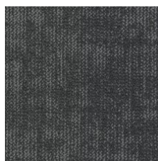
Lava 05500 LRV 6.5 | L* 30.75