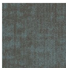
Lake 05327 LRV 12.2 | L* 41.55