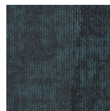
Oceans 05405 LRV 5.9 | L* 29.04