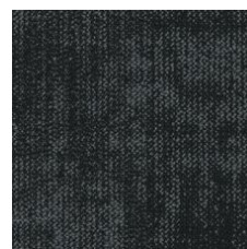
Deepest 05505 LRV 3.6 | L* 22.39