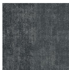
Untamed 05595 LRV 12.5 | L* 41.99