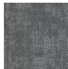
Radiant 05515 LRV 18.1 | L* 49.57