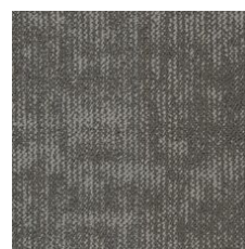
Mountain 05761 LRV 14.6 | L* 45.04