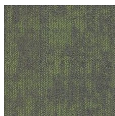
Nature 05326 LRV 15.8 | L* 46.7