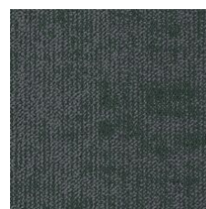
Forests 05334 LRV 6 | L* 29.37