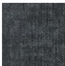
Calm 05580 LRV 7.1 | L* 32.09