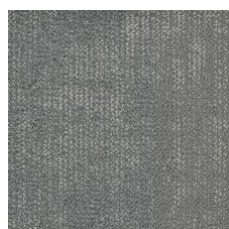
Optimistic 05105 LRV 22.1 | L* 54.1