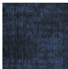
Skies 05486 LRV 4 | L* 23.62