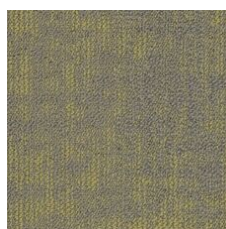
Ochre 05225 LRV 20.9 | L* 52.86