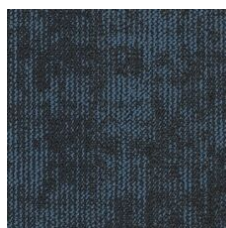
Springs 05440 LRV 6.3 | L* 30.06