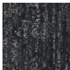
Souk 01500 LRV 3.8 | L* 22.92