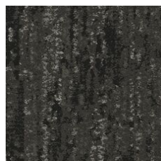
Henna 01585 LRV 3.7 | L* 22.57