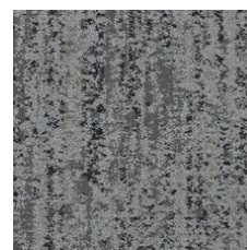
Silver 01535 LRV 14.9 | L* 45.49