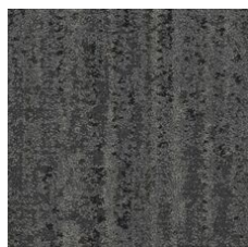
Crafted 01580 LRV 7 | L* 31.7