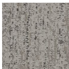
Wool 01105 LRV 20.6 | L* 52.49