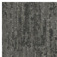
Blended 01555 LRV 11.3 | L* 40.08