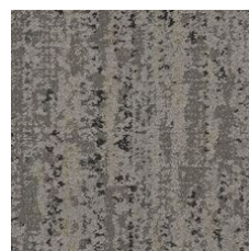
Riad 01518 LRV 14.5 | L* 44.96