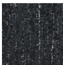
Medina 01505 LRV 6 | L* 29.42