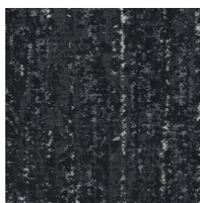
Medina 01505 LRV 6 | L* 29.42