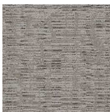
Wool 01105 LRV 19.2 | L* 50.89