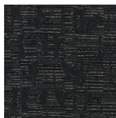
Souke 01500 LRV 3 | L* 19.93