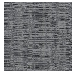
Silver 01535 LRV 13.2 | L* 43.05