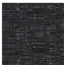
Medina 01505 LRV 4.5 | L* 25.12