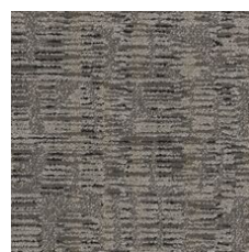
Riad 01518 LRV 12.5 | L* 41.96