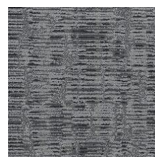
Silver 01535 LRV 13.2 | L* 43.05