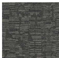
Blended 01555 LRV 8.8 | L* 35.54