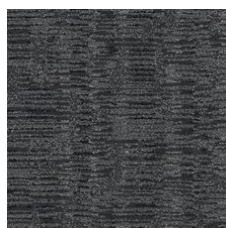
Crafted 01580 LRV 6.8 | L* 31.27