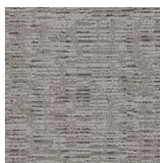
Wool 01105 LRV 19.2 | L* 50.89