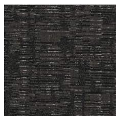
Henna 01585 LRV 3.8 | L* 22.87