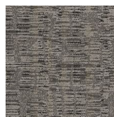
Riad 01518 LRV 12.5 | L* 41.96