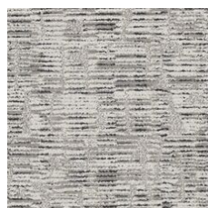
Argan 01100 LRV 32.4 | L* 63.67