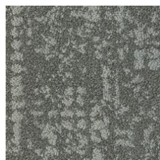
Mountain 05761 LRV 18.5 | L* 50.06