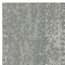
Optimistic 05105 LRV 17.8 | L* 49.3