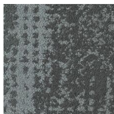
Fragile 05760 LRV 11.1 | L* 39.77