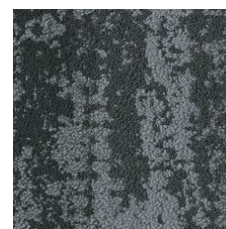
Calm 05580 LRV 9.4 | L* 36.7