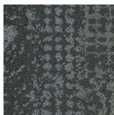
Lava 05500 LRV 8.4 | L* 34.87