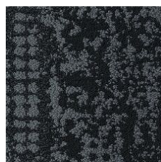
Deepest 05505 LRV 6.2 | L* 29.88