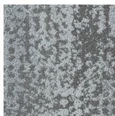
Radiant 05515 LRV 21.6 | L* 53.57