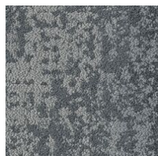
Untamed 05595 LRV 13.7 | L* 43.81