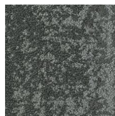
Wild 05557 LRV 11.1 | L* 39.7