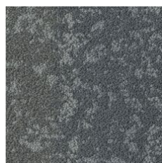
Untamed 05595 LRV 12.9 | L* 42.69