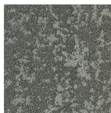
Mountain 05761 LRV 18.1 | L* 49.64