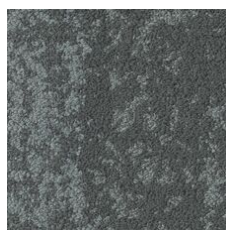
Fragile 05760 LRV 14.5 | L* 44.99