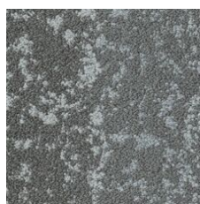
Radiant 05515 LRV 21.6 | L* 53.58