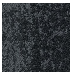
Deepest 05505 LRV 5.6 | L* 28.29