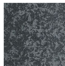
Calm 05580 LRV 9.5 | L* 36.88