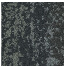
Lava 05500 LRV 6.9 | L* 31.68