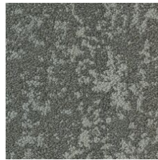
Mountain 05761 LRV 18.1 | L* 49.64

➡ Quick Ship Immediate - APAC Instock - Up to 300sqm