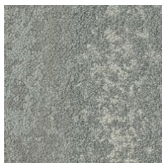
Optimistic 05105 LRV 20.9 | L* 52.84