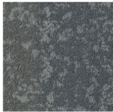
Untamed 05595 LRV 12.9 | L* 42.69