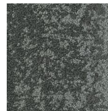
Wild 05557 LRV 11.1 | L* 39.7