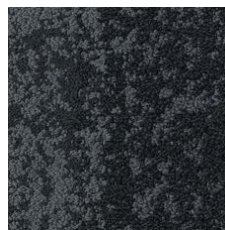
Deepest 05505 LRV 5.6 | L* 28.29