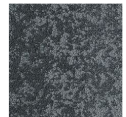
Calm 05580 LRV 9.5 | L* 36.88