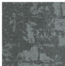
Fragile 05760 LRV 15.2 | L* 45.93