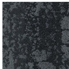
Deepest 05505 LRV 5.3 | L* 27.49