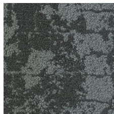
Lava 05500 LRV 7.3 | L* 32.44