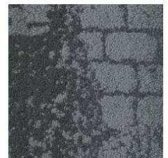
Calm 05580 LRV 11.1 | L* 39.71