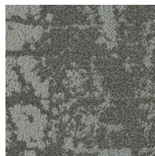
Mountain 05761 LRV 12.5 | L* 41.94