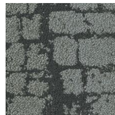
Wild 05557 LRV 12.2 | L* 41.57