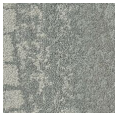
Optimistic 05105 LRV 23.3 | L* 55.42