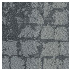
Untamed 05595 LRV 16.1 | L* 47.04