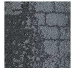
Calm 05580 LRV 11.1 | L* 39.71