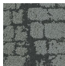
Wild 05557 LRV 12.2 | L* 41.57