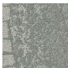
Optimistic 05105 LRV 23.3 | L* 55.42