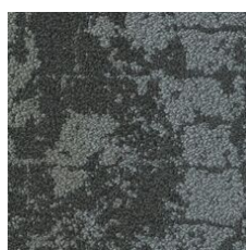
Lava 05500 LRV 7.3 | L* 32.44