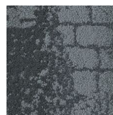
Calm 05580 LRV 11.1 | L* 39.71