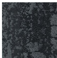
Deepest 05505 LRV 5.3 | L* 27.49