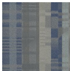
Cyan Chrome 23515 LRV 22.2 | L* 54.27