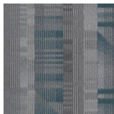
Glass Concrete 23535 LRV 15.9 | L* 46.83