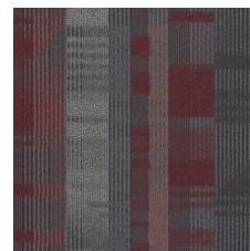
Pigment Beam 23580 LRV 7.9 | L* 33.8