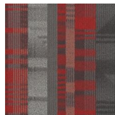
Crimson Rope 23555 LRV 13.7 | L* 43.87