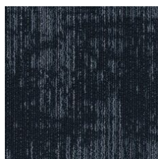
Lacquer 58496 LRV 4.3 | L* 24.59