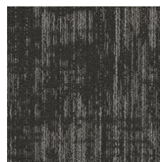
Bristle 58515 LRV 7.2 | L* 32.28