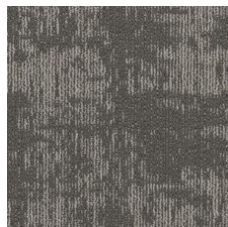
Glaze 58761 LRV 13.6 | L* 43.71