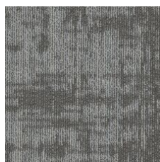
Graphite 58510 LRV 14.2 | L* 44.58