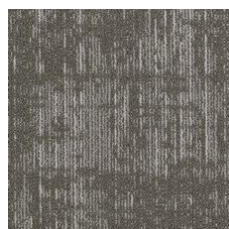
Twine 58111 LRV 18 | L* 49.48