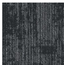
Ink 58505 LRV 4.9 | L* 26.4