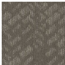
Cadence 27740 LRV 15.1 | L* 45.7