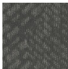
Orchestrate 27550 LRV 11.8 | L* 40.88