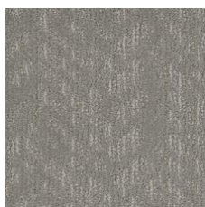
Calm 27120 LRV 27.1 | L* 59.07