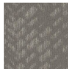
Pause 27720 LRV 22.1 | L* 54.12