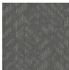
Pitch 27540 LRV 15.6 | L* 46.47