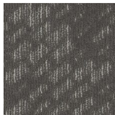
Interval 27770 LRV 9.8 | L* 37.45