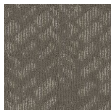
Cadence 27740 LRV 15.1 | L* 45.7