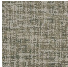
Recollect 85215 LRV 24.8 | L* 56.84