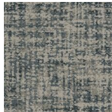
Timeless 85402 LRV 25 | L* 57.04