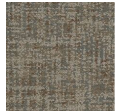
Nostalgic 85665 LRV 17.2 | L* 48.47