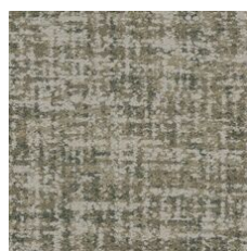
Recollect 85215 LRV 24.8 | L* 56.84