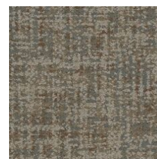
Nostalgic 85665 LRV 17.2 | L* 48.47