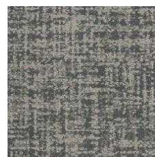
Heritage 85530 LRV 18.1 | L* 49.64