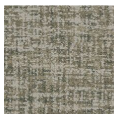
Recollect 85215 LRV 24.8 | L* 56.84