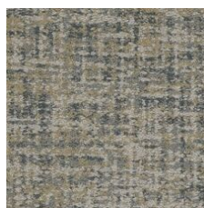
Classic 85496 LRV 22.8 | L* 54.91