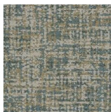
Novelty 85327 LRV 23.4 | L* 55.46