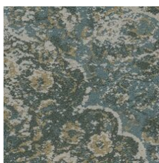
Novelty 85327 LRV 21.2 | L* 53.15