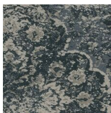
Timeless 85402 LRV 24.6 | L* 56.65