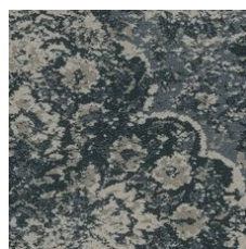
Timeless 85402 LRV 24.6 | L* 56.65