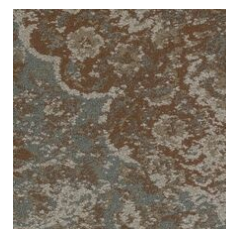
Nostalgic 85665 LRV 14.7 | L* 45.26