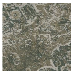
Recollect 85215 LRV 24.4 | L* 56.5