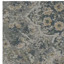
Classic 85496 LRV 23.6 | L* 55.66