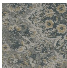
Classic 85496 LRV 23.6 | L* 55.66