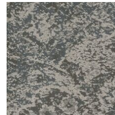
Heritage 85530 LRV 15.4 | L* 46.21