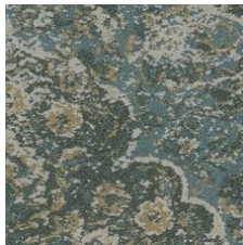
Novelty 85327 LRV 21.2 | L* 53.15