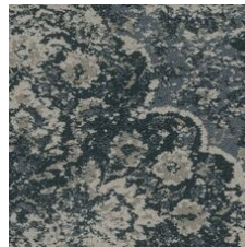
Timeless 85402 LRV 24.6 | L* 56.65