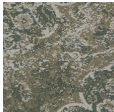
Recollect 85215 LRV 24.4 | L* 56.5