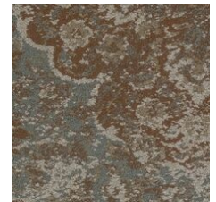
Nostalgic 85665 LRV 14.7 | L* 45.26