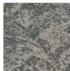
Heritage 85530 LRV 15.4 | L* 46.21