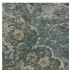
Novelty 85327 LRV 21.2 | L* 53.15