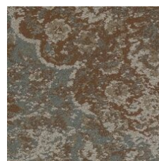
Nostalgic 85665 LRV 14.7 | L* 45.26