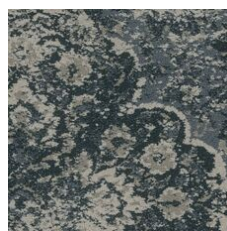
Timeless 85402 LRV 24.6 | L* 56.65