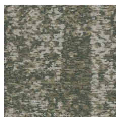
Recollect 85215 LRV 22.6 | L* 54.63