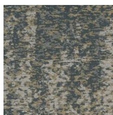
Classic 85496 LRV 17.4 | L* 48.74