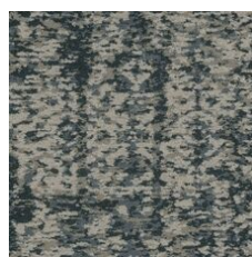
Timeless 85402 LRV 19.6 | L* 51.39