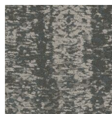
Heritage 85530 LRV 13.4 | L* 43.34