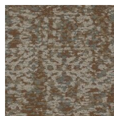
Nostalgic 85665 LRV 14.5 | L* 44.97