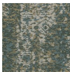
Novelty 85327 LRV 24.5 | L* 56.59