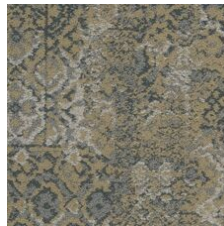
Classic 85496 LRV 19.1 | L* 51.67