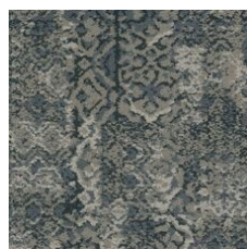
Timeless 85402 LRV 18.6 | L* 50.23