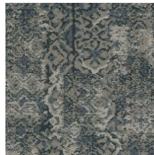
Timeless 85402 LRV 18.6 | L* 50.23