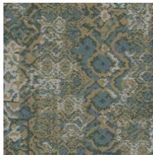
Novelty 85327 LRV 18.2 | L* 49.74