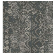
Heritage 85530 LRV 14.6 | L* 45.03