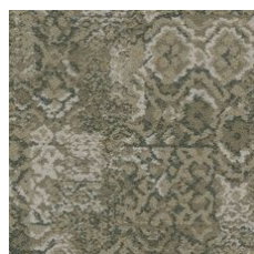
Recollect 85215 LRV 21.3 | L* 53.3