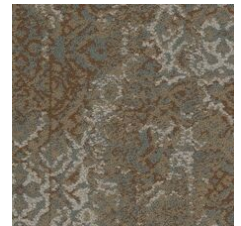
Nostalgic 85665 LRV 16.2 | L* 47.22