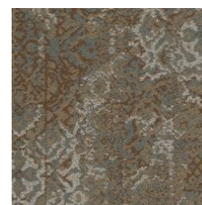
Nostalgic 85665 LRV 16.2 | L* 47.22