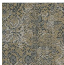
Classic 85496 LRV 19.1 | L* 51.67