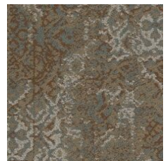
Nostalgic 85665 LRV 16.2 | L* 47.22