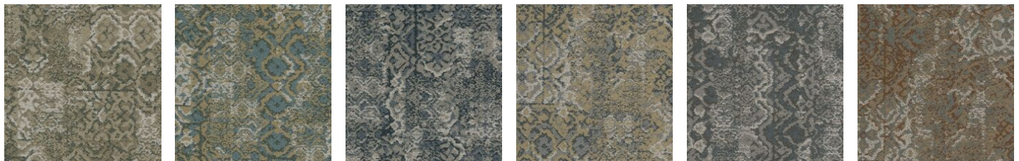
Recollect 85215 LRV 21.3 | L* 53.3