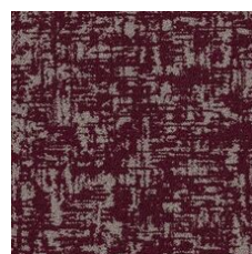
Flora 71850 LRV 9 | L* 35.94