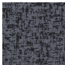
Distant 71505 LRV 9.5 | L* 36.9