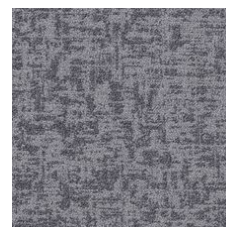
Remote 71580 LRV 18.3 | L* 49.81