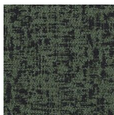
Meadow 71375 LRV 7.1 | L* 32.65