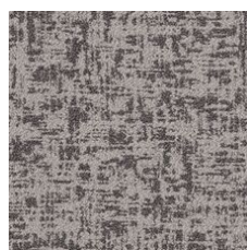
Expansive 71760 LRV 22.3 | L* 54.38