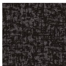
Plateau 71585 LRV 5.4 | L* 27.72