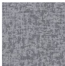
Pristine 71535 LRV 23.2 | L* 55.25