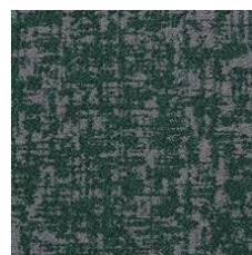
Forest 71396 LRV 9.1 | L* 36.11