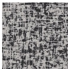
Birch 71500 LRV 25 | L* 57.03