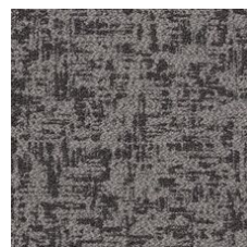
Opulent 71555 LRV 13.2 | L* 43.03