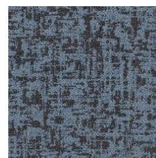
Sky 71411 LRV 12.9 | L* 42.65