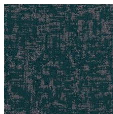
Coast 71323 LRV 6.2 | L* 29.98