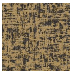
Earth 71225 LRV 16.3 | L* 47.3