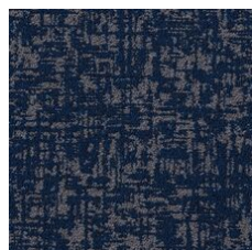
Reservoir 71485 LRV 6.3 | L* 30.14