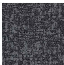
Stone 71595 LRV 7.7 | L* 33.33