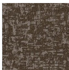
Summit 71761 LRV 10.1 | L* 37.94