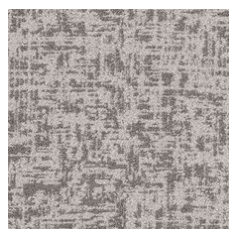
Brilliant 71105 LRV 26.3 | L* 58.36