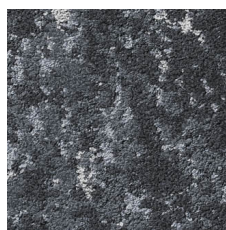
Ridge 15580 LRV 11.4 | L* 40.26